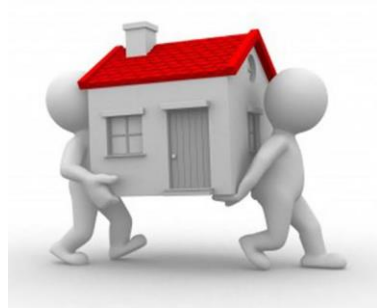
Synonyms: snatch, taken off Antonyms: rendered, given

Meaning; To deprive of property; to fleece.